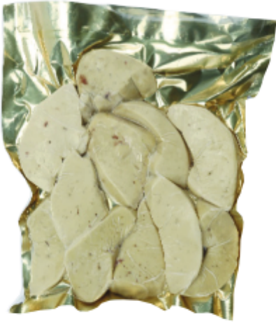
FOIE GRASS SLICED