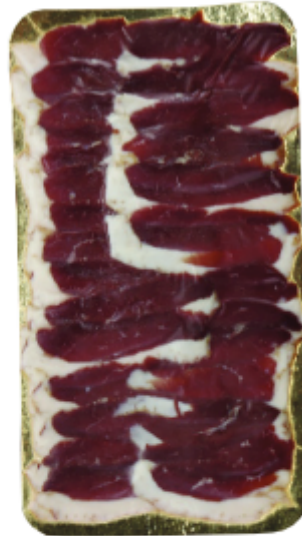
SMOKED DUCK MAGRET